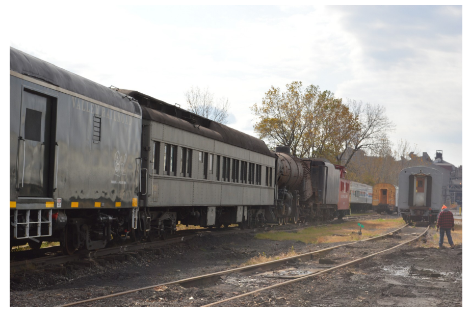
One thing that did not please me was loco 4070, a 2-8-2 at the end of these passenger cars. Behind 4070 was a repainted caboose. Nice job! Work was being done on the tracks leading to the roundhouse.